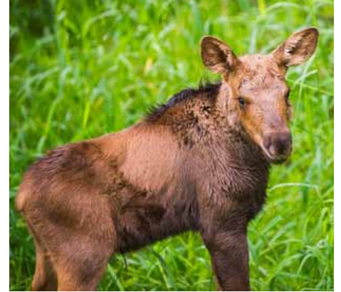
Baby moose born in June at NWT